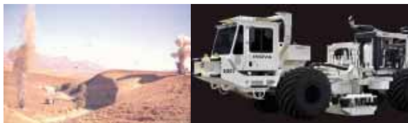
Fig. 1: Traditional seismic acquisition on land is done with dynamite or seismic vibrators

In populated and/or environmentally sensitive areas, it is often not possible to employ highly energetic seismic sources. Geophysicists at the Department of Geotechnology at Delft University of Technology, the Netherlands, are developing a seismic imaging method that employs ambient seismic noise that comes from microseismicity or cultural activity. This method, which is called 'seismic interferometry' (SI), circumvents the use of manmade seismic sources. SI is not going to replace the traditional seismic method, but it will form an attractive addition to it. Apart from the mentioned advantage for hydrocarbon exploration in sensitive areas, SI can also be applied to monitor processes in the subsurface, such as CO 2 sequestration, over a longer period of time. Moreover, because SI can be applied at different scales, it is of interest to image the larger structures in the Earth's interior.